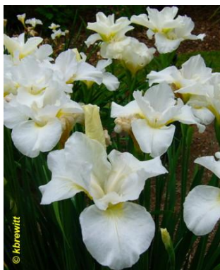
'Swans In Flight' SIB (Hollingworth, 2006)

(Best iris from a hybridizer NOT in Region)