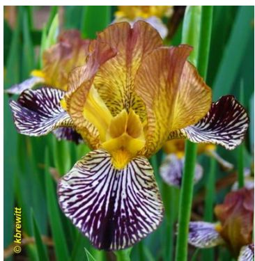
'Moose Tracks' MTB (Lynda Miller, 2015)