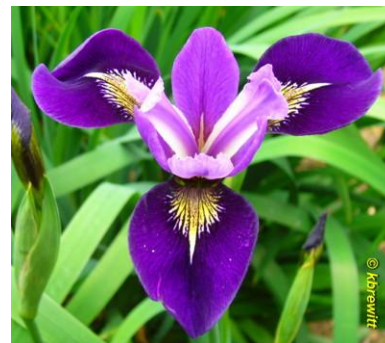
'Do The Math' SPX (Copeland, 2008)