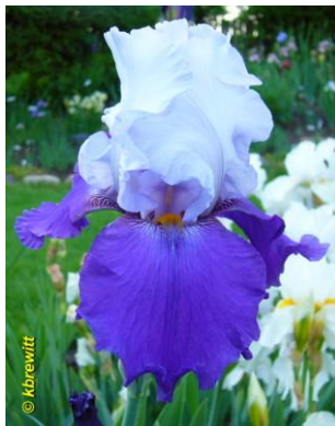
1 st choice: TB – 'Lady Baltimore'

It seems people take a close look at our irises and selections are being made based on not just the colour of the iris but on its attributes. For example, Iris pallida was admired because of its heavenly scent even though it has a non-descript blue flower. Another iris admired by many was 'Mesmerizer'. Most would consider the flower as 'just a white' however some looked beyond that and selected it because of the interesting flounces at the end of its beard. 'Kiss of Caramel' intrigued many visitors because they had never seen a Spuria iris before and thought it novel. And 'Black Magic Woman' was popular because of the velvety-look texture on the falls. In the end, the top six selected were as follows. Thanks to all who participated.