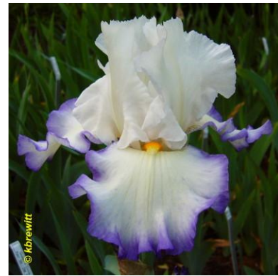
Tie for 2 nd choice: TB – 'Queen's Circle'