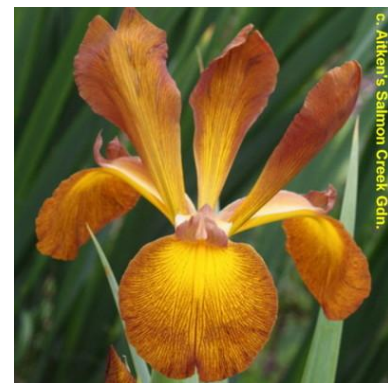
3-way tie for 3 rd choice: SPU – 'Kiss of Caramel'