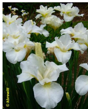
'Swans In Flight' SIB (Hollingworth, 2006)