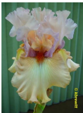
Tie for 2 nd choice: TB – 'Chic Attire'