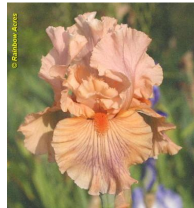
3-way tie for 3 rd choice: TB – 'Judy Nunn'