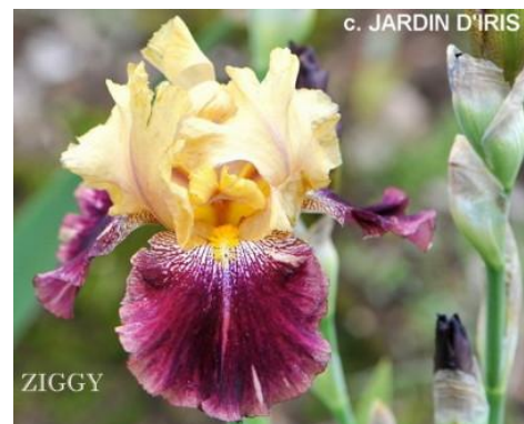
3-way tie for 3 rd choice: TB – 'Ziggy'