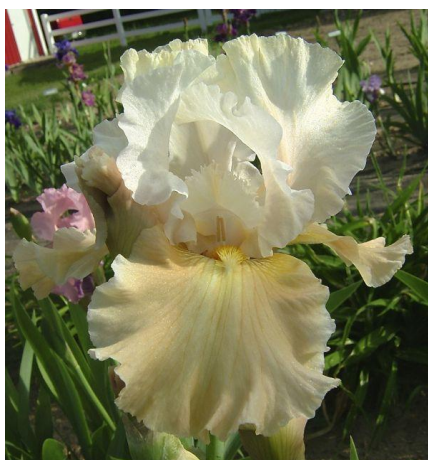
2 nd choice: TB – 'Champagne Elegance'

The second placed iris, 'Champagne Elegance', is an historic iris from 1986. People noticed the pale pink colouring in the standards which nicely accented the soft apricot-coloured falls.