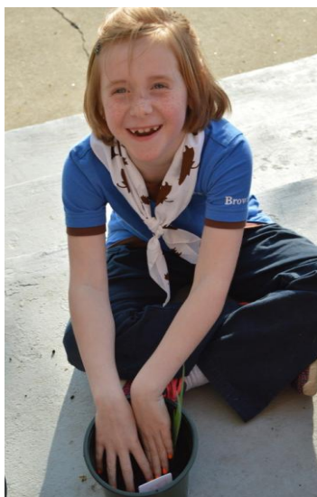
Potting an iris rhizome

In May some of our youth members and their Brownie pack had a chance to learn about irises. They were given a talk about irises then each was given an iris rhizome to plant in a pot so they could take it home. Some of the girls are already keen gardeners so they were very pleased to receive their plant. Here is one of our youth potting her iris.