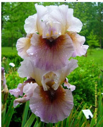
'Hearts of Hearts' (Black, 2015)