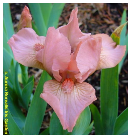
'Pussycat Pink' (Black, 2006)

However, the most popular iris was the candy pink SDB with hot pink beards, 'Pussycat Pink'. So popular in fact that most visitors went home with a pot of this iris in hand.