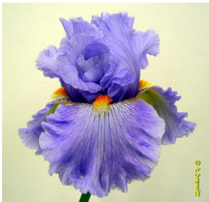
Exhibitor: Lyn Hickey Iris: TB 'No Place Like Home' (Black, 2011)