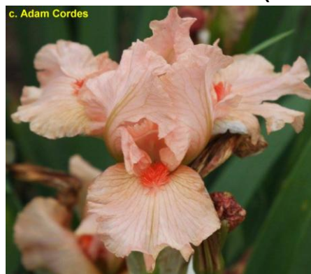
'Portland Pink' (Black, 2015)