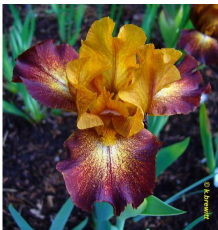
3 rd choice: IB – 'Hot Spice'

The third choice, 'Hot Spice', is a combination of muted gold and burgundy. People commented on the deep, rich colours. Definitely different!