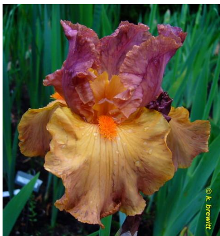
1 st choice: TB – 'Earthborn'

The second placed iris, 'Champagne Elegance', is an historic iris from 1986. People noticed the pale pink colouring in the standards which nicely accented the soft apricot-coloured falls.