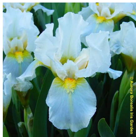
'Teagan' (D.Spoon, 2009)

The iris that I was sure was going to be the most popular was the SDB 'Teagan'. As if knowing it is in contention for this year's Cook-Douglas Medal, our clump put on an impressive show. Dozens of soft blue/white blooms with brilliant yellow beards danced above the foliage eliciting approving comments from visitors as they entered the garden.