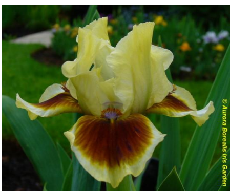
'Sonador' (D.Spoon, 2011)

Next in popularity was Don Spoon's, 'Sonador'. Light ruffling and flared falls add to the crisp form of this iris. The dark lavender-blue beard makes for a stunning contrast against the yellow-brown fall spot.