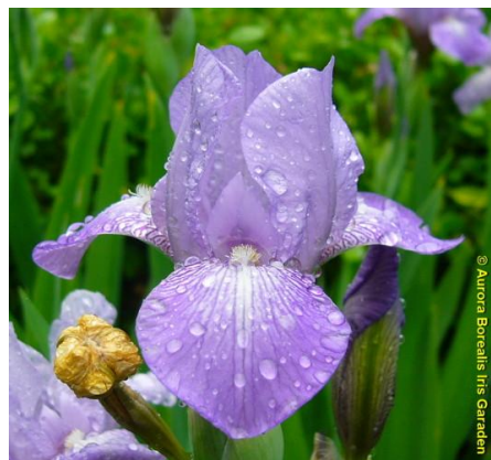
'At Last My Blue' MTB (Ken Fisher, 2015)

(Best clump from a hybridizer outside Region 6)