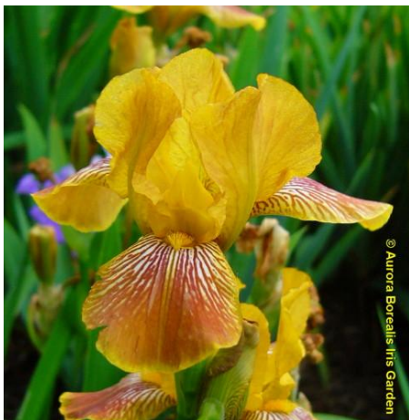
'Breakfast in Bed' MTB (Chuck Bunnell, 2014)