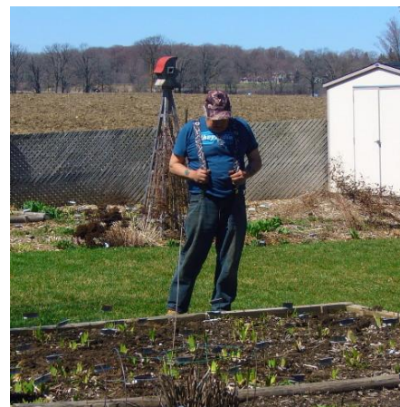
Saying goodbye to a garden well loved.