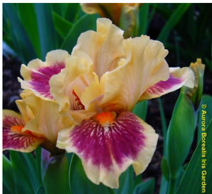
'Eye of the Tiger' (Black, 2008)

Rounding out the top five favourites were three more SDBs, 'Eye of the Tiger', which was in the top five last year, 'Pink Twilight' and the Cook-Douglas contender, 'Teagan'.