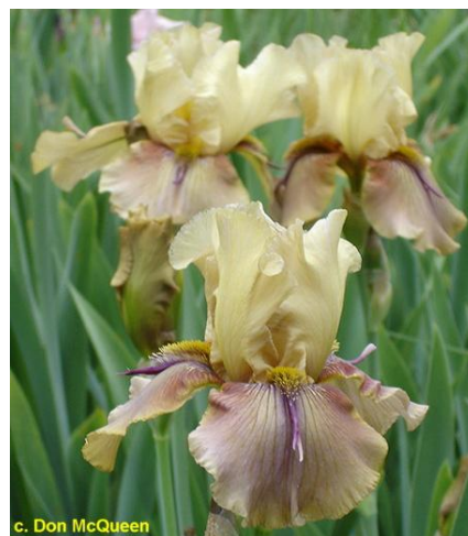
4 th choice: TB – 'Thornbird'

In fourth place was the 'love-it or hate-it' iris, 'Thornbird'. For those who liked it the dark purple horns, which contrasted against the pale greenish tan falls, are what caught their eye. Some people had never seen horns on an iris and thought it was novel.