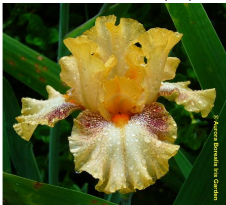
'Impertinent' (Filardi, 2011)