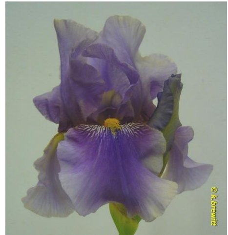
Seedling 01-49-01 – Jinny Missons