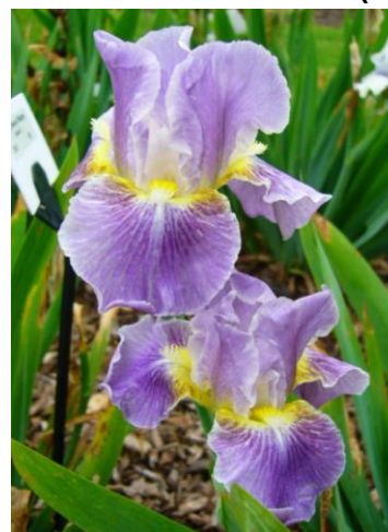
'Deep Secret' (Lauer, 2015)