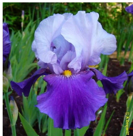
5 th choice: TB – 'Twilight Fancies'

In fourth place was the 'love-it or hate-it' iris, 'Thornbird'. For those who liked it the dark purple horns, which contrasted against the pale greenish tan falls, are what caught their eye. Some people had never seen horns on an iris and thought it was novel.