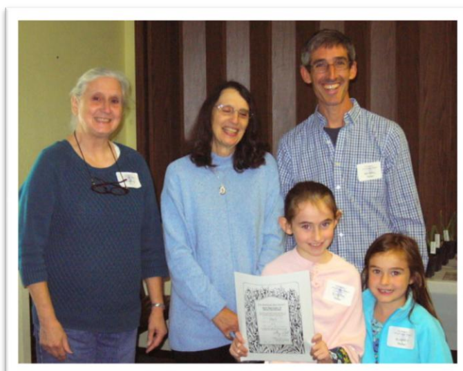
A Proud Family