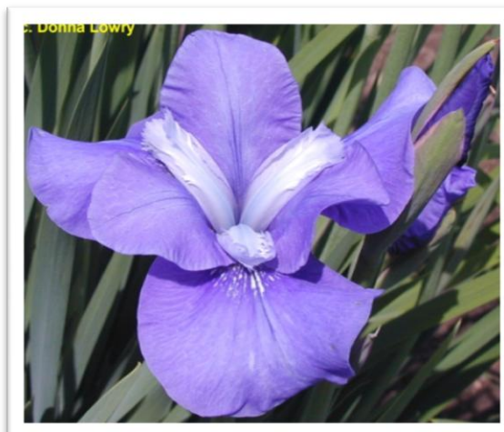
'Seneca Glacier Flow' (D. Borglum, 2000)