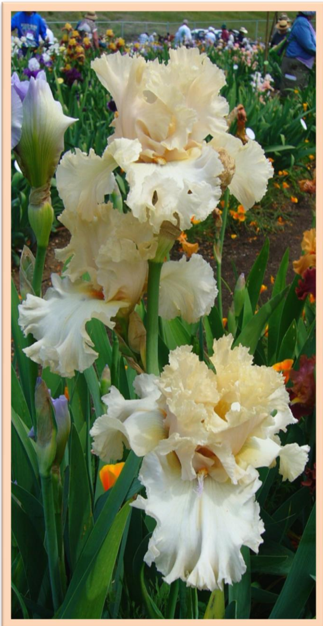
'Dial A Doll' (Burseen, 2016)