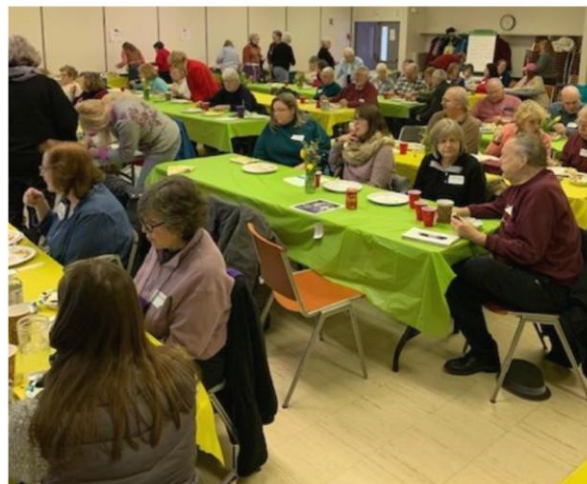
Enjoying the Annual Doldrums Luncheon