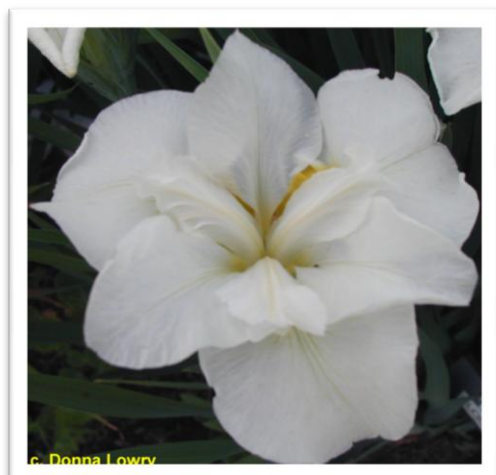
'Seneca Cloud Puffs' (D. Borglum, 1995)

There are still many Borglum irises that require images. Please contact Terry ( tlaurin@rogers.com ) if you have any pictures to share.