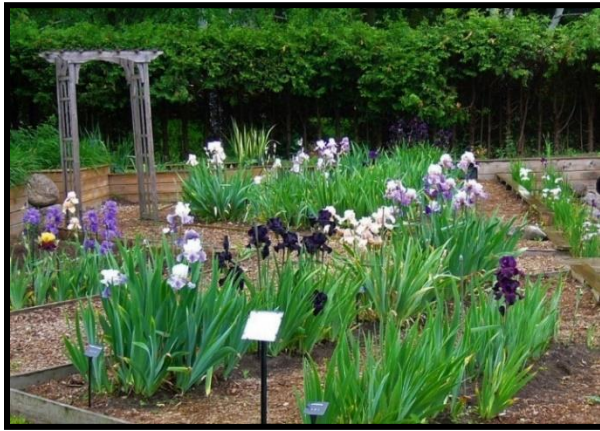
Irises in Bloom

Despite the rain we headed out to Arbour Gardens, east of Newcastle, ON, on a Monday, day three of a three-day open garden. Apparently, we picked the 'best day' to visit as people had lined up to get in the previous two days. Today, we had the place to ourselves!