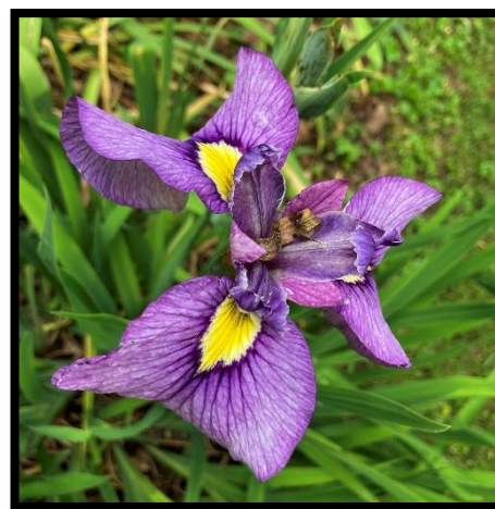
SPX 'Shiryukyo' (Shimizu, 2008)

The Bassett property is sloped, with the house placed in the middle part of the land. An extensive drainage system diverts any runoff water away from the house and into a lower area of the property near the road (where clumps of I. pseudacorus had bloomed earlier in the season and a huge unidentified clump of Japanese iris was currently in full bloom). We evaluated large clumps of named beardless iris cultivars that were growing in three different areas of the yard: behind the house in full sun near a small pond and patio area; along the side of the house underneath a large tree with low over-hanging branches; and in beds in front of a grouping of mature ornamental trees in the front yard.