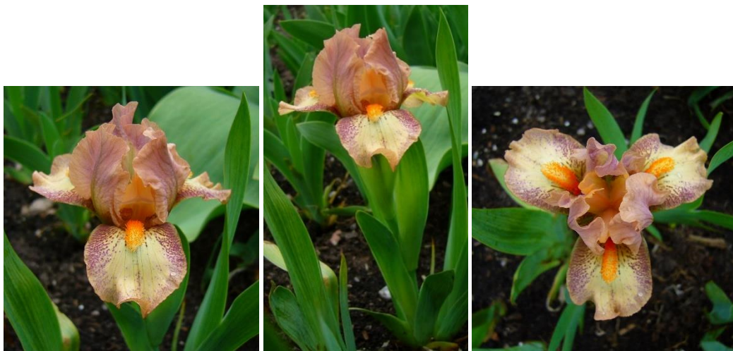
'Calico Lace' submitted by Kate Brewitt in the Standard Dwarf Bearded Section

In July we held another on-line rhizome sale. All classes of bearded irises were offered, supplied by our members. Iris lovers from British Columbia to New Brunswick took advantage of this offer. All proceeds go towards future ONIS events.