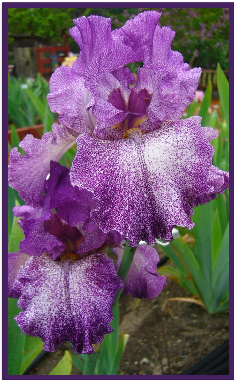
'Autumn Explosion' (R. Tasco, 2013) Wister Medal 2019