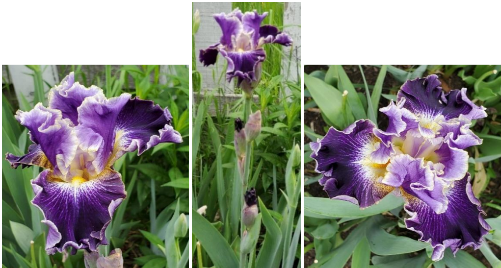
'Belle Filles' submitted by Andrea Karpinsky in the Tall Bearded Section