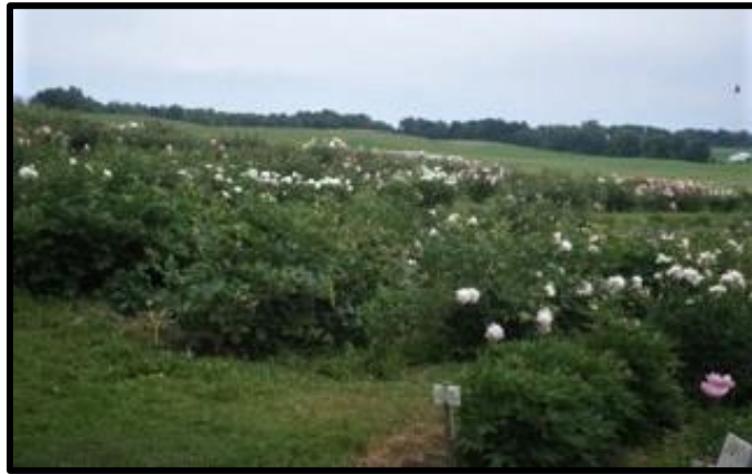
View Overlooking Iris Country Gardens