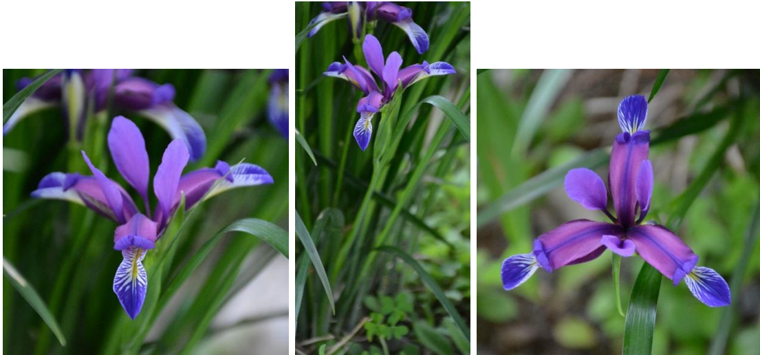
Division I, Section L: SPEC I. graminea #1 entered by Cora Roller

Division I, Section K: Japanese – no entries