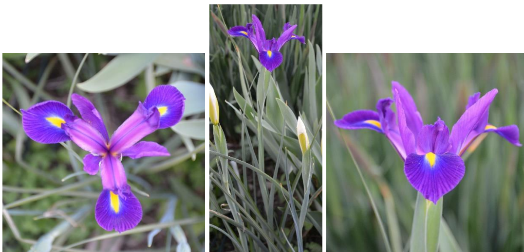
Division I, Section N: BULBOUS - I. hollandica entered by Aubrey Roller