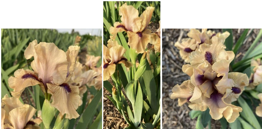
'Endless Moments' submitted by David Retallick in the Intermediate Bearded Section