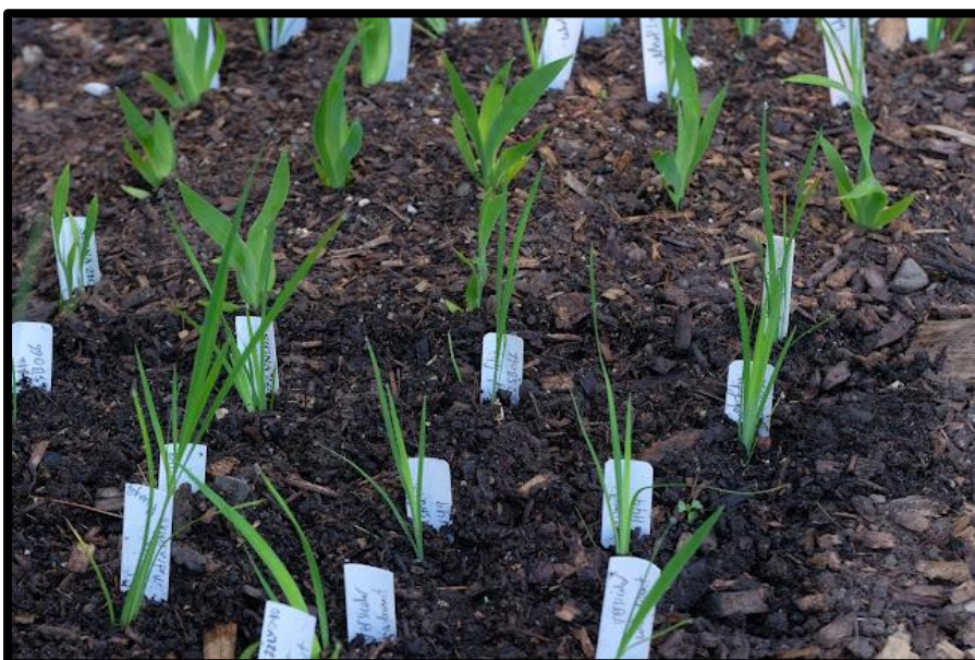
Iris seedlings, transplanted into the garden in July. Note: each seedling has a label because I am growing many different varieties in a limited space.