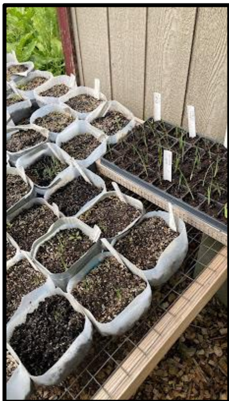
Iris seedlings in milk jugs in early spring, with the tops of the jugs removed. Some of the seedlings have been moved to module trays (top right).

Keep in mind, these seedlings will not be clones of the parent but instead crosses of that parent that set the seed and whatever plant donated the pollen. No matter what, it will be a unique iris. Give it a few years in your garden to see how it develops, multiplies, blooms, etc. It might fail to impress the first year it blooms. Or you might be pleasantly surprised.