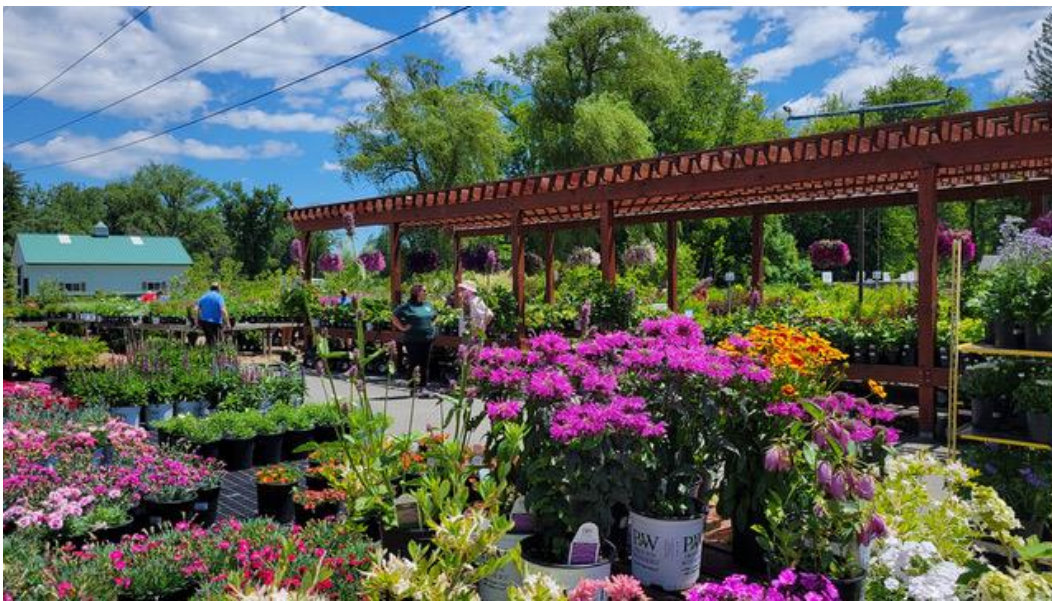
The Gade Farm visit, June 2024