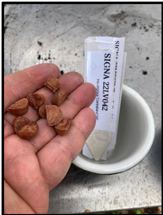
Iris versicolor seeds, from SIGNA 2023

Irises need just a little special treatment to jump-start germination. There is a coating on iris seeds that inhibits germination, and that coat needs to be washed off. Once the inhibition coat has been rinsed off, the seeds need a lengthy cold period called stratification. This amounts to a cold, moist period that helps prepare seeds to germinate once the weather warms up. There are a few ways to get seeds through this rinsing and stratification process. The simplest is to plant your seeds outdoors in pots, usually in late fall when you're planting bulbs. Plant them twice the depth of the seed, not too deep, (don't forget your label!), then water them and leave them be till spring. Many years you'll get some germination in early spring, with the caveat that without washing off the inhibition coat, you might see some germination staggered over the summer and into the following year.