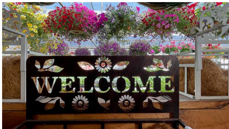
The Gade Farm Welcome, June 2024