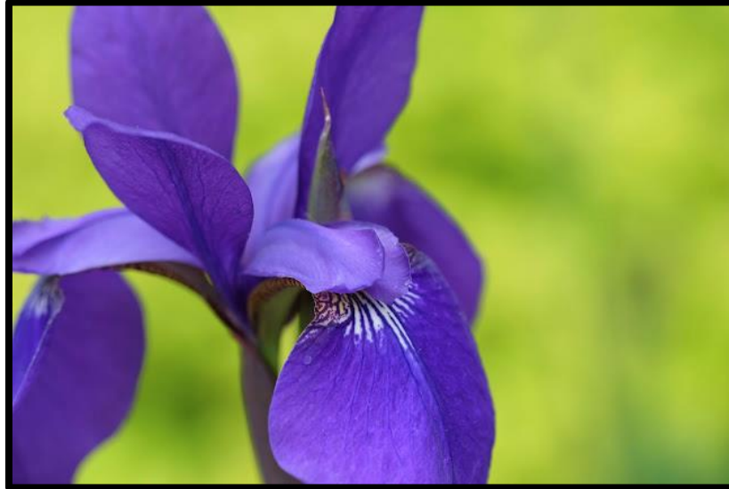
SIB 'Caesar's Brother' (Morgan, 1932) © Alex Solla

On the surface, this should be straight forward. Stick seeds in dirt, watch them come up, poof! Irises.