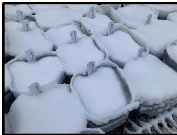
Some gardeners have successfully started iris seeds with the winter-sowing method of using gallon milk jugs with seeds stratified throughout the long winter.

Alternately, if you wash your seeds by soaking them and changing their water daily for about 10 days, then store them in your fridge (in moist but not wet peat moss in a lidded container) for about 90-100 days, you'll see a much higher rate of successful germination.