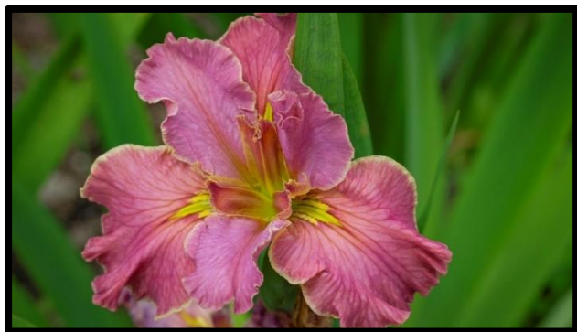
LA 'Cone Of Uncertainty' (O'Connor, 2015)