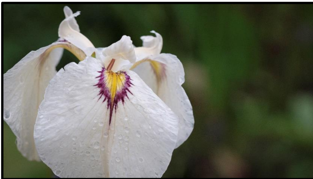
SPX (Pseudata) 'Yukiyanagi' (Shimizu by Warner, 2010)

Facebook: Greater Rochester NY Irises | Facebook