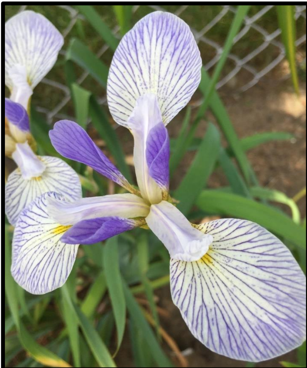
SPX ( I. versicolor ) 'Cascade Mist' (Borglum, 1999) © Wendy Roller

Hints to enjoying longer iris bloom seasons: grow early, mid-season, and late blooming iris varieties in each classification; utilize sun and shade patterns within your growing area; and experiment with growing other different species of irises which might perform well in your climate zone.