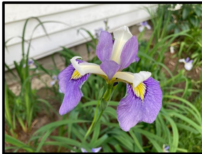
SPX 'Enfant Prodige' (Huber, 1997) © Wendy Roller

The bulbous I. reticulata irises usually start blooming in a south-facing raised bed around St. Patrick’s Day; and they continue blooming in various sunny and semi-shady places in the yard for about 30 days. Early, mid, and late season miniature dwarf, standard dwarf, intermediate, border, miniature-tall, and tall bearded irises, as well as the species irises I. tectorum and I. graminea , then keep the “consecutive days in bloom” count going until sometime in the second week of June. The Louisiana irises, Siberian irises, and several I. setosa seedlings then extend the iris season of bloom even further. Prior to 2024, my longest continuous iris bloom season occurred in 2023 – 108 days of irises in bloom.