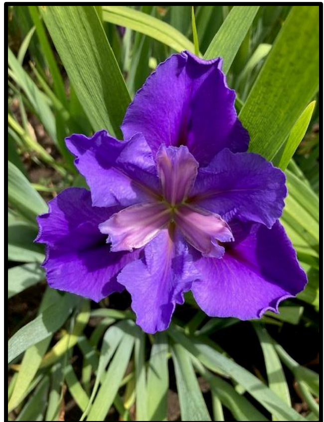
LA 'Acadian Sky' (Musacchia, 2017) © Wendy Roller