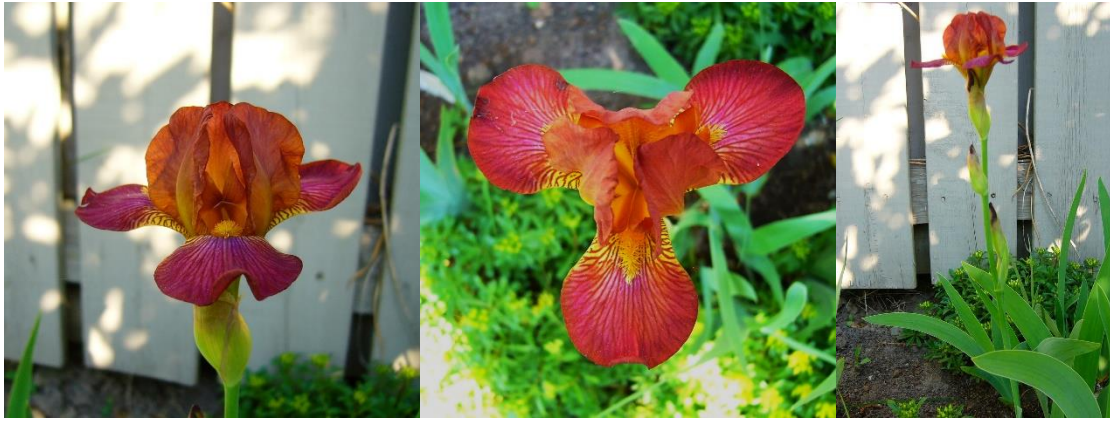
'Hot News' submitted by Kate Brewitt in the Miniature Tall Bearded Section