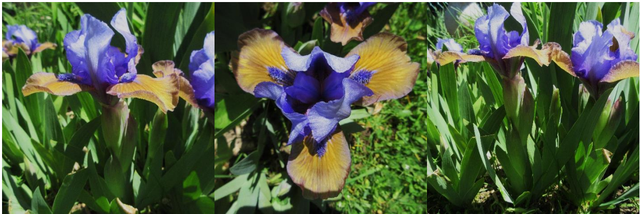
'Blueberry Tart' submitted by Lyn Hickey in the Standard Dwarf Bearded Section

In the end there were over sixty entries submitted by four eager photographers. A $10 Tim Hortons gift card was given to each participant as a thank you for their efforts. Below are just some of the entries received.