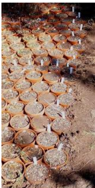
Seeds planted into pots sunk in the ground (gravel on top protects from washout)

The simplest way to meet these two requirements is to plant the seeds outdoors in the autumn or early winter, and let nature take its course--assisting with supplemental water if natural precipitation is insufficient. Seeds can be planted straight in the soil, or in pots sunk into the ground or just left on a porch or in a cold frame. A planting depth of 1 cm or 1/2 inch is suitable for most seeds. Germination usually occurs around the time of iris bloom in the spring.