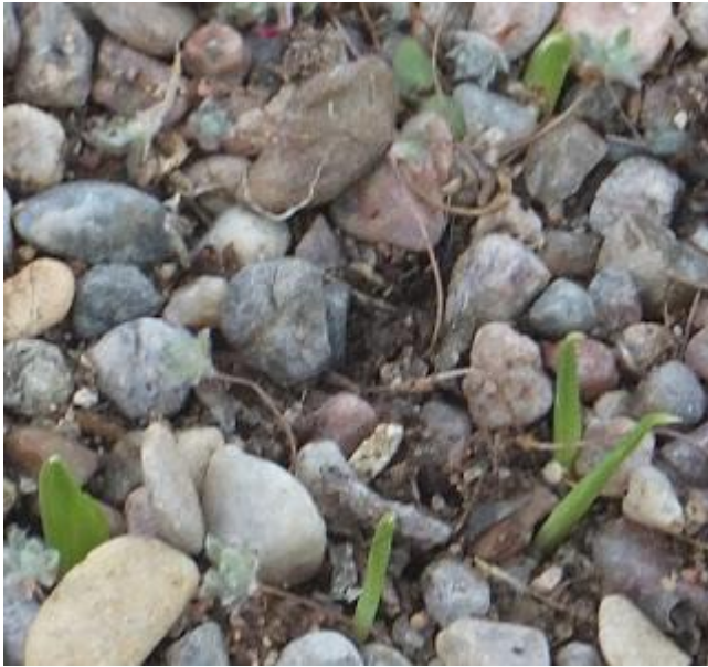
Newly sprouted seedlings!

possibility of getting germination a few months earlier. The disadvantage is that you need to be prepared to grow on the seedlings indoors under grow lights for some time, until they are ready to be hardened off and planted outdoors.