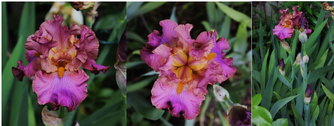
'Dance the Night Away' submitted by Karen Lockyear in the Tall Bearded Section