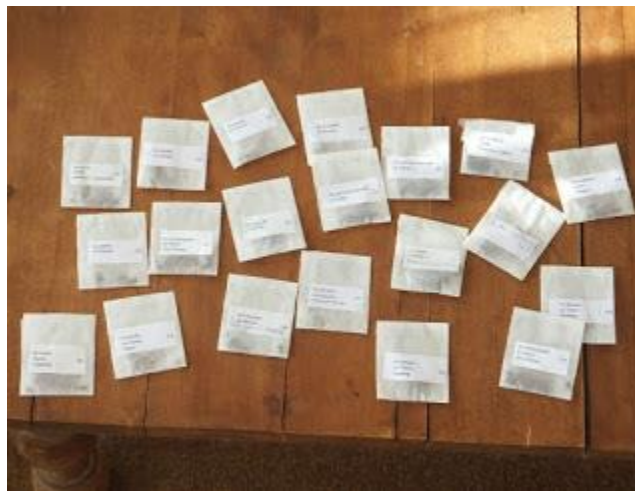
Woohoo! Iris seeds just arrived from Czechia

Propagating by division only creates exact copies of the original plant, whereas propagation from seed creates only brand-new plants, different from either parent. Even if you are not intending to embark on serious hybridizing program to create new varieties to sell commercially, making crosses and raising seedlings can be fun and interesting.