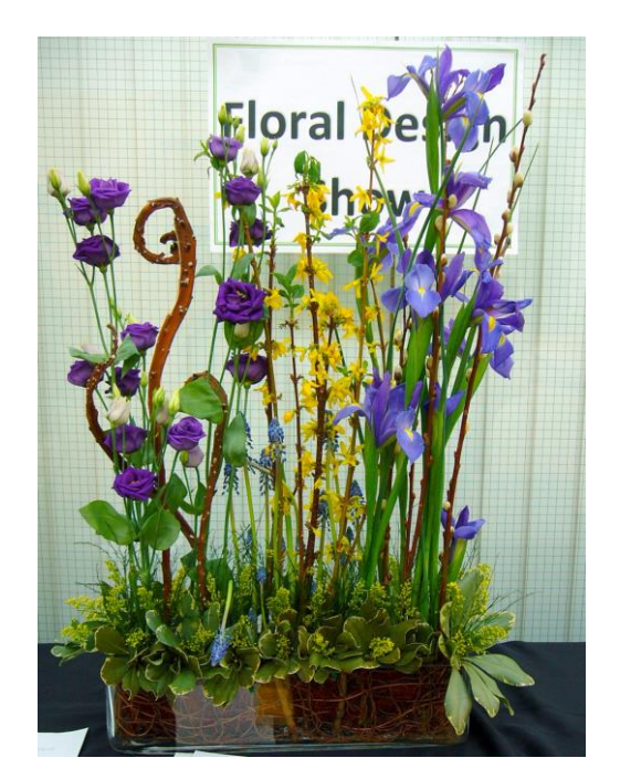
Blooming Dutch Iris in a display at the Floral Design Show