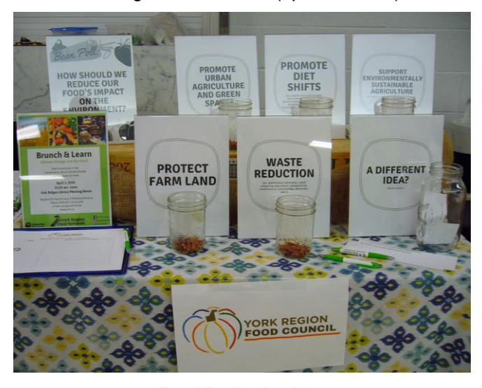
Food Reduction Vote