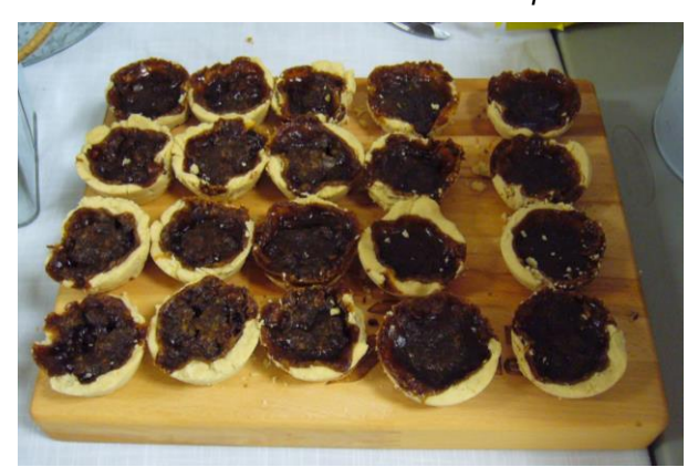
Vegan Butter Tarts