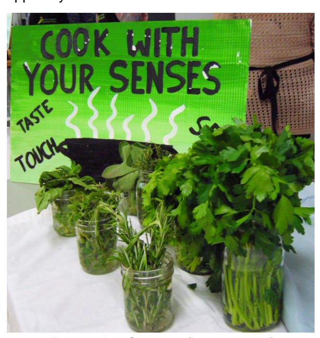
Testing Your Senses - (I passed! - ed)

There is always plenty to do at the York Region Food Market's Seedy Saturday. The ever-popular Kid's Corner had kids planting bean seeds, making buttons and colouring pictures. There was a booth where you could test your senses by smelling and touching herbs in an effort to guess their names, and I participated in a vote for ideas to reduce our food's impact on our environment by putting beans in different 'idea' jars. I also watched a smudge ceremony conducted by an Indigenous elder from The Three Sisters' house. It was a fun day with lots to do. It was also nice to chat with those of you who stopped by the booth!