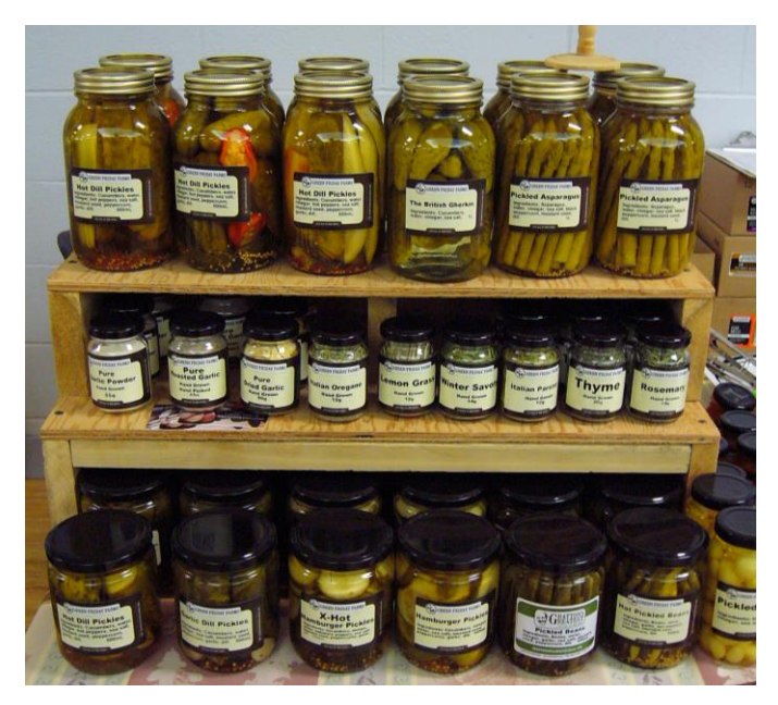
Homemade Pickled Foods and Spices