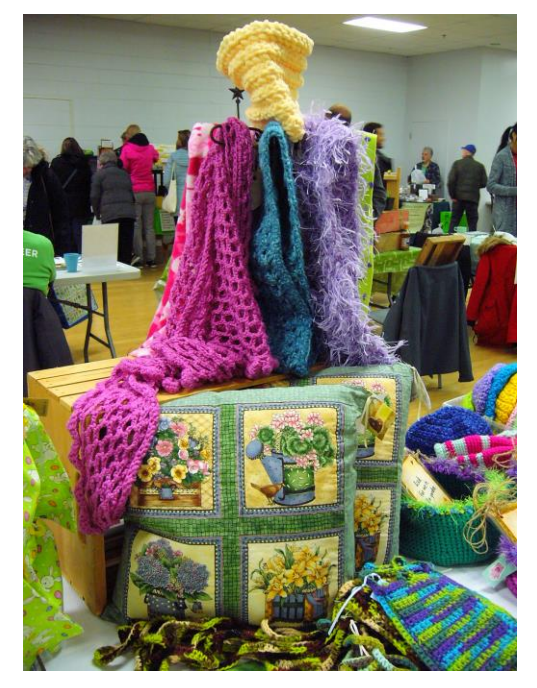
Lots of homemade crafts for sale