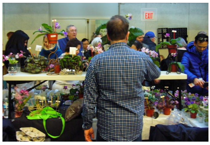
A Crowded African Violet Booth