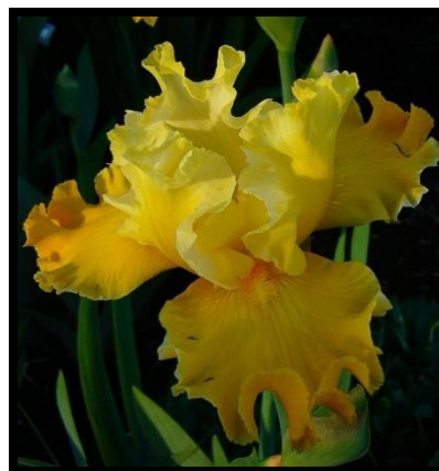
TB 'Greet The Sun' One of the irises available in the ONIS on-line sale.

We have tried to make this as simple as possible however, if you have any problems, please contact me at kbrewitt@rogers.com .