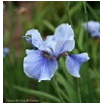
I. 'Super Ego'