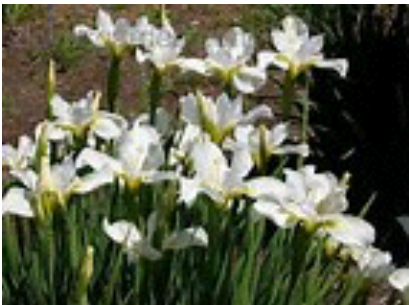
I. 'White Swirl'